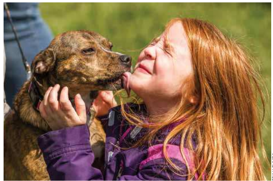
Thanks to everyone who showers us with love by supporting key Friends fundraisers like Mutt Strut, where fun, games, and puppy kisses abound.