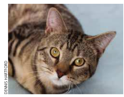
Tango says our four new satellite cat centers are the cat's meow — visit one today!

ore of our shelter cats are finding fur-ever homes thanks to a change made in our off-site adoption strategy earlier this year. Instead of hosting weekend events (where adoptions were dwindling), the Friends are showcasing our felines every day at four pet supply stores: Petco Detroit (2005 8 Mile Road W.), PetSmart Dearborn (5650 Mercury Drive), PetSmart Taylor (23271 Eureka