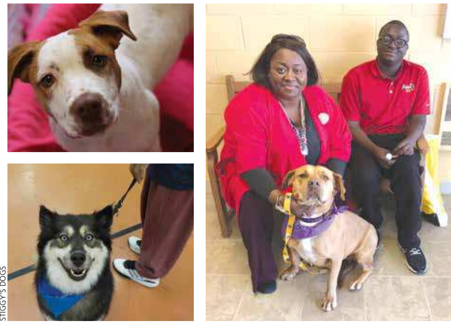
So far this year, seven Dearborn Animal Shelter pups have participated in the Stiggy's Dogs S.T.a.R. prison training program, including these three (clockwise from lower left): Cypher (formerly Wes) enlisted in the program over the summer. • Spidey completed the 12-week training and has been paired with a veteran. • Elsia graduated from S.T.a.R. and was adopted by the family of her inmate handler.

And the dogs, of course, receive training and human interaction that increases their chances of finding a permanent home. Those that make good cadets in Stiggy's psychiatric service dog program are paired with a veteran. Those who do not seem to be a match may be placed with a waiting adopter or returned to the shelter for adoption. Either way, it's a shining opportunity! •